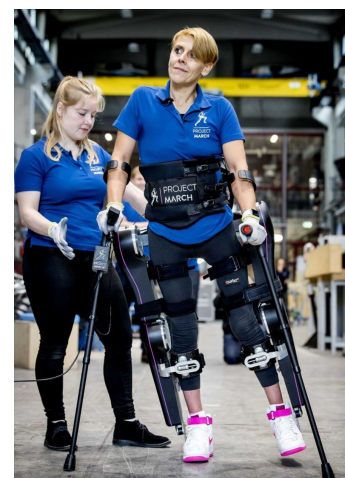
Figure 2: Project March from TU Delft. The student organization supported by the Technical University Delft currently works on the 7th generation of their exoskeleton. The project started in 2016. Reprinted with permission from https://www.projectmarch.nl/en/project-march .