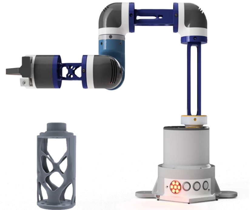
Fig. 1: Lightweight optimized modular multi-component system

The position is suitable to be filled by severely disabled persons. Severely disabled applicants will be given preference in the case of otherwise essentially equal suitability, ability and professional performance. TUM promotes equality between women and men. Data protection notice: With your application to the Technical University of Munich (TUM), you are transmitting personal information. In this regard, please note the data protection information in accordance with Article 13 of the General Data Protection Regulation (DSGVO) on the collection and processing of personal data in the context of your application ( http://go.tum.de/554159 ). By submitting your application, you confirm that you have taken note of the above-mentioned TUM data protection information.