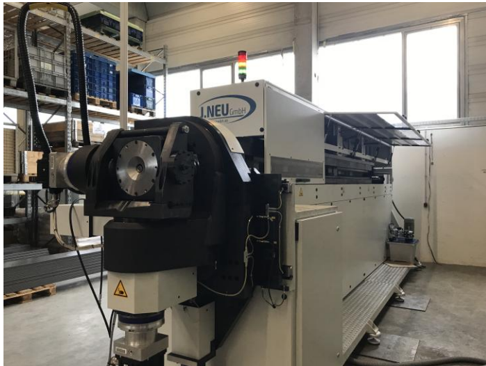
Figure 1: 6-axis-free-form bending machine.

The free-form bending machine is able to bend tubes and profiles of various radii without any tool change. The biggest advantage of the free-form bending with movable die is the seamlessly connection of different radii in one part. Particularly suitable areas of application for this machine are those involving work pieces of different sizes with large radii.